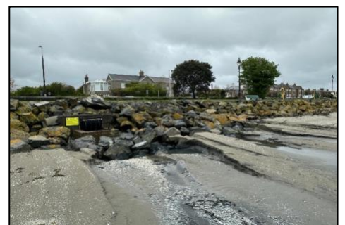
Here's an example of a discharge in April 2025.