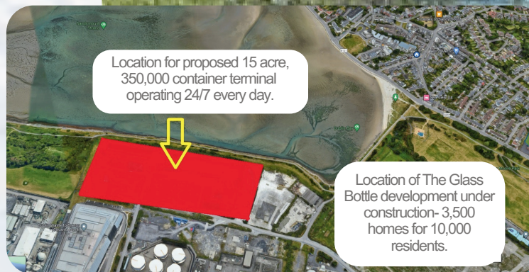
Location for proposed 15 acre, 350,000 container terminal operating 24/7 every day.