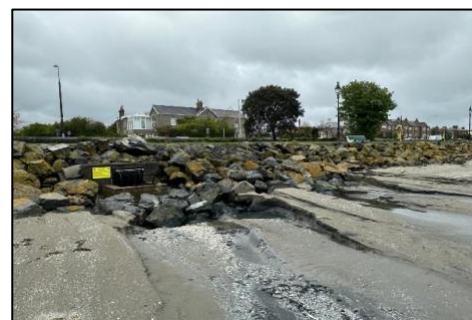
Here's an example of a discharge in April 2025.