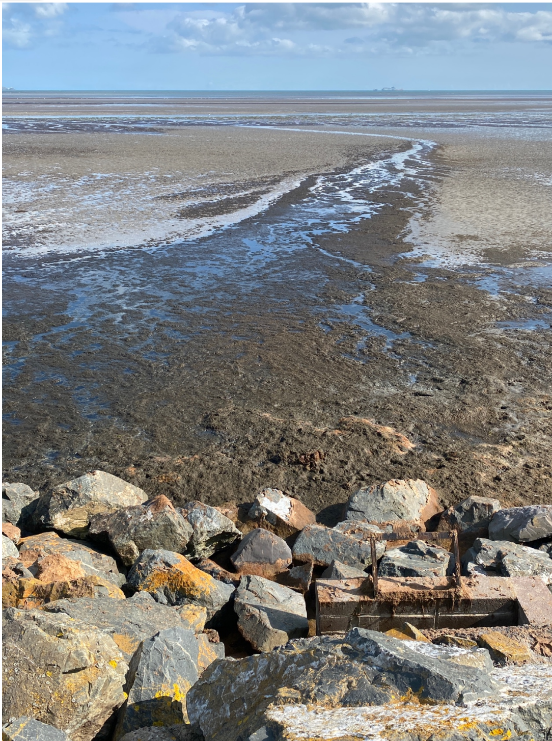
Pictures taken 26 th September 2023 from the public footpath path at St Albans pump outlet demonstrating the erosion and ponding which occurs at the discharge. Beneath the light covering of weed lies the sewage detritus, which routinely discharges as per video link found on website : SAMRA.ie