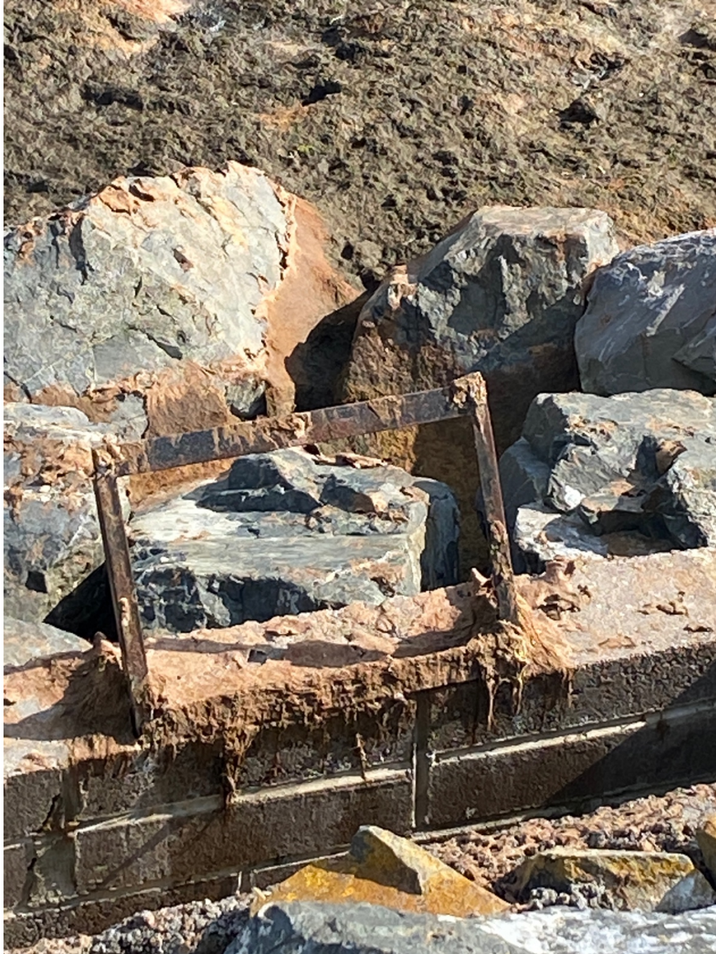
The remains of the accessible public hazard signage.....